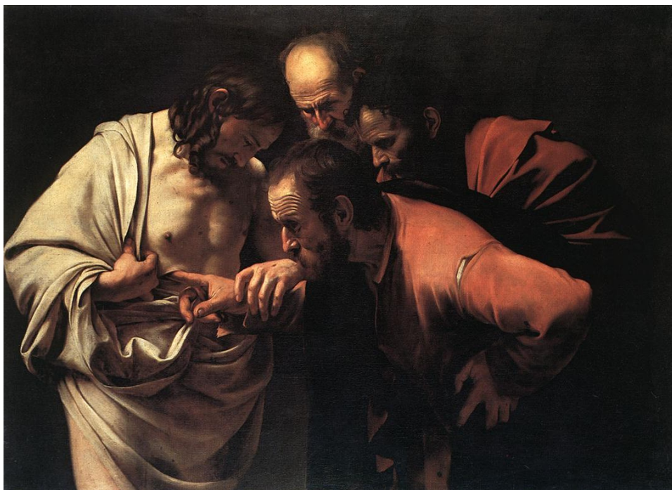
Caravaggio: The Incredulity of St Thomas 1601-02