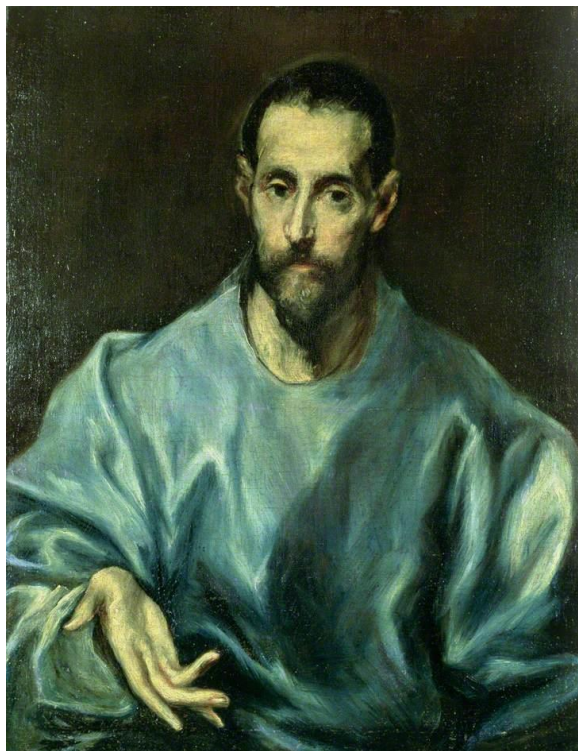
St James the Greater, El Greco (1541–1614), New College, Oxford

Sixteenth Sunday in Ordinary Time 22 July 2018