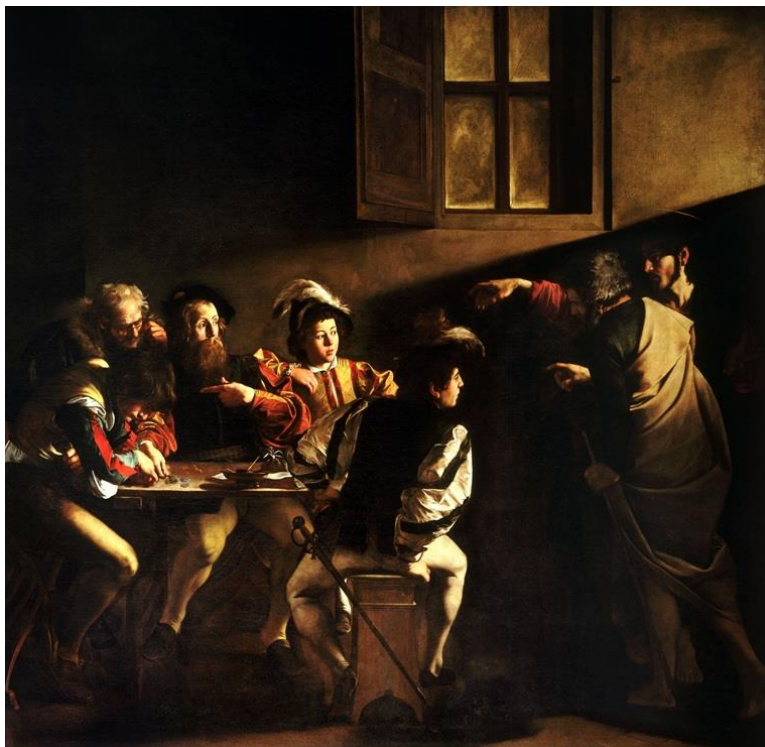
Caravaggio, The Calling of St Matthew 1599-1600 San Luigi dei Francesi, Rome

Twenty Fourth Sunday in Ordinary Time 16 September 2018