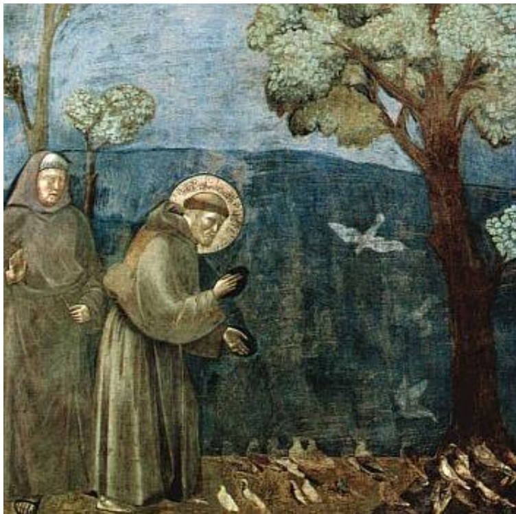
Giotto: St Francis preaching to the Birds 1297-1299 Assisi

Twenty Sixth Sunday in Ordinary Time 30 September 2018