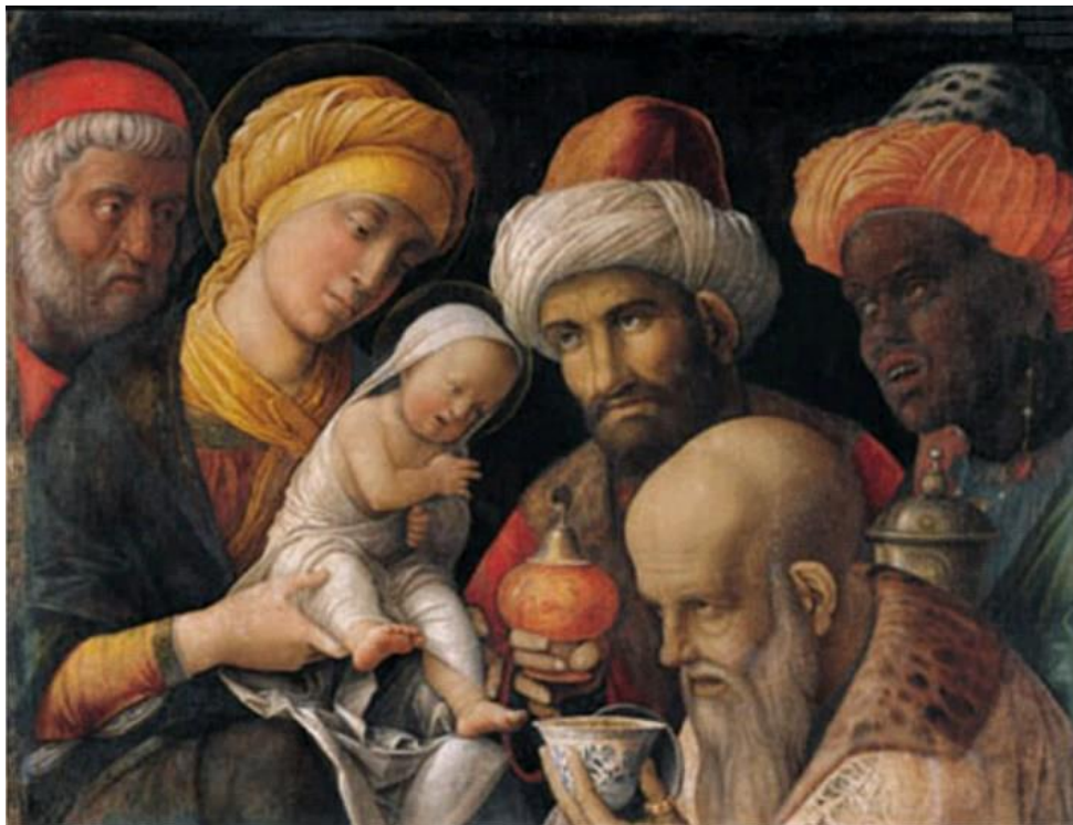
Andrea Mantegna - Adoration of the Magi (1497-1500 circa) National Gallery, London