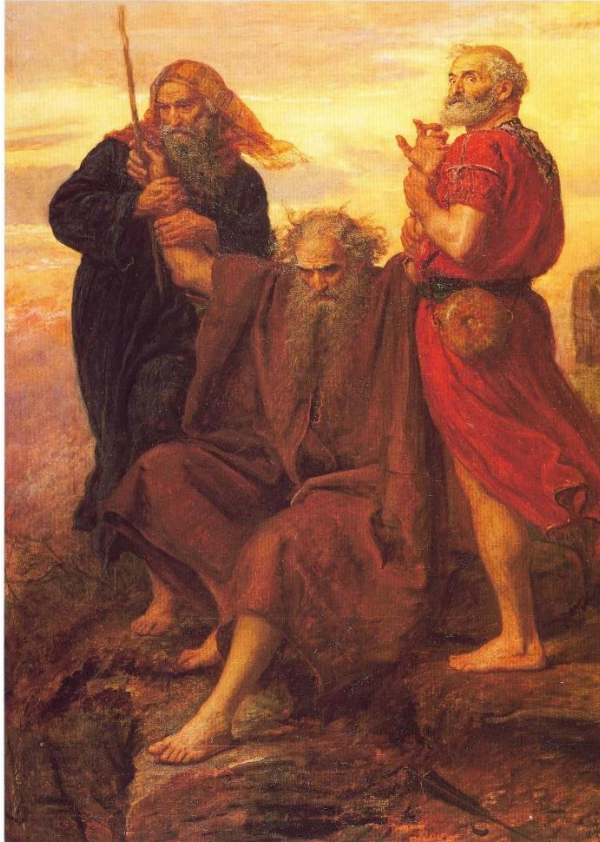
John Everett Millais, Victory O Lord! 1871 Manchester Art Gallery

Twenty-ninth Sunday of the Year 20 October 2019