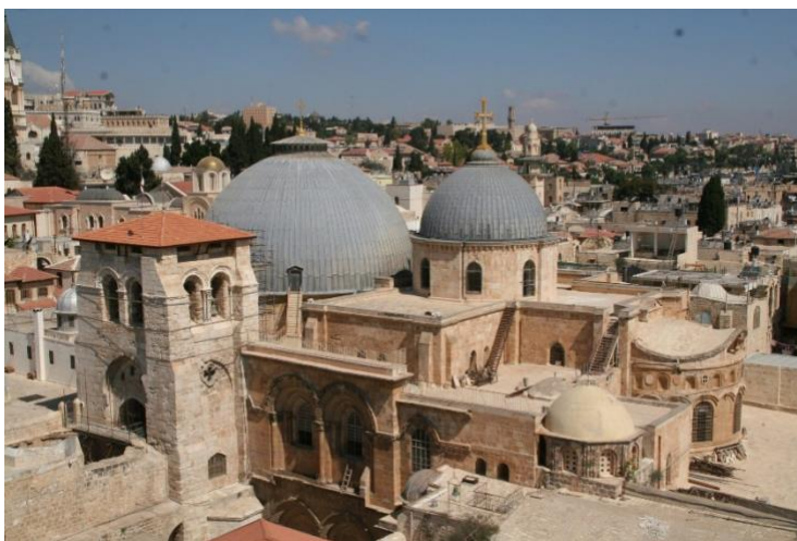
The Church of the Holy Sepulchre in Jerusalem contains both the sites of Jesus' Crucifixion & Resurrection. Built by the Emperor Constantine, rebuilt by the Crusaders and in the Custody Greek, Latin & Armenian churches, the Syrian, Coptic & Ethiopian churches are also represented.