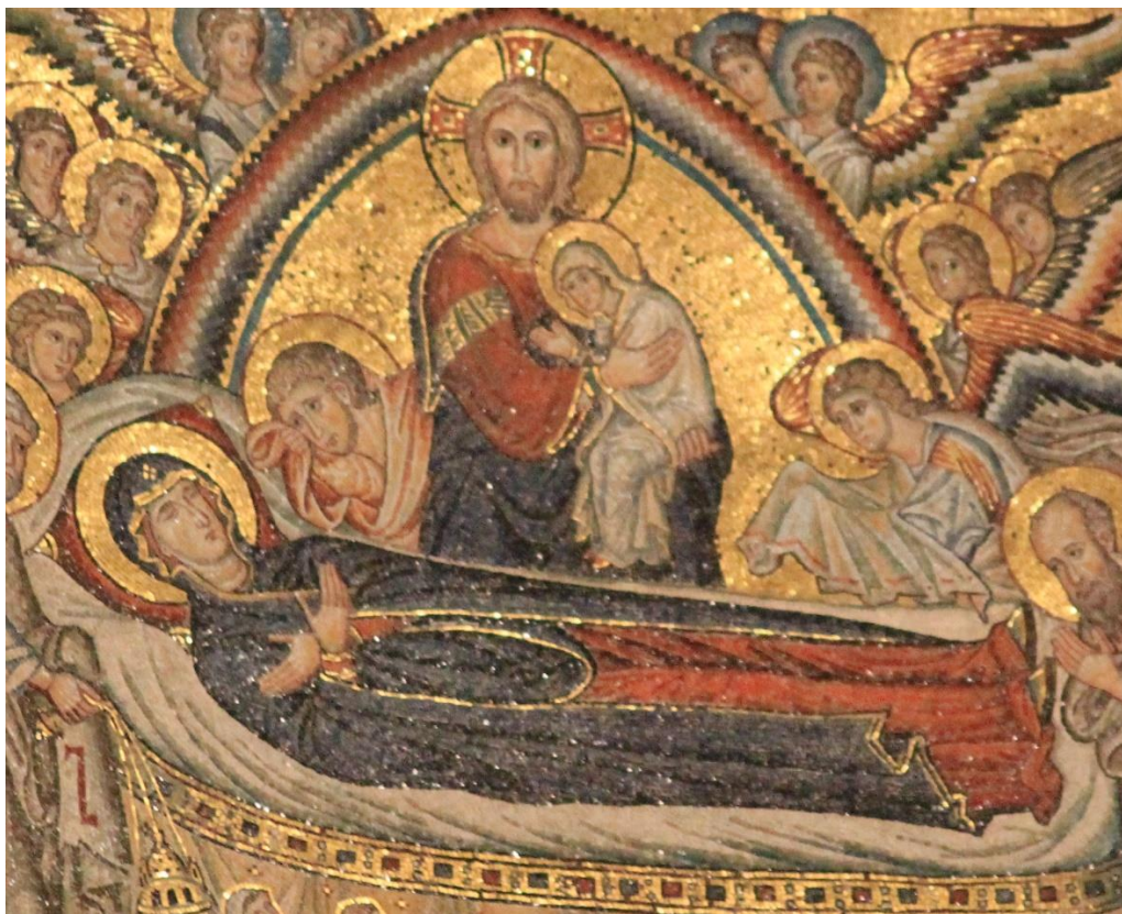
Jacopo Torriti the Dormition of Mary (apse mosaic) 1296 Santa Maria Maggiore, Rome