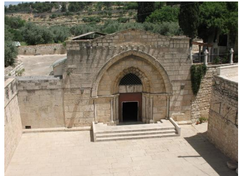
Mary's Tomb, Kidron Valley, Jerusalem