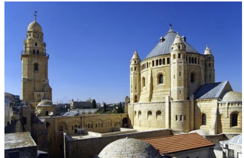
Church of the Dormition, Mt. Zion, Jerusalem