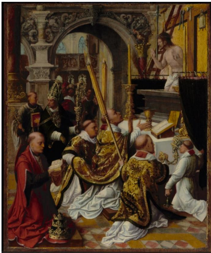
Ysenbrandt The Mass of Saint Gregory the Great 1510–1550 Los Angeles

Twenty second Sunday in Ordinary Time 30 August 2020