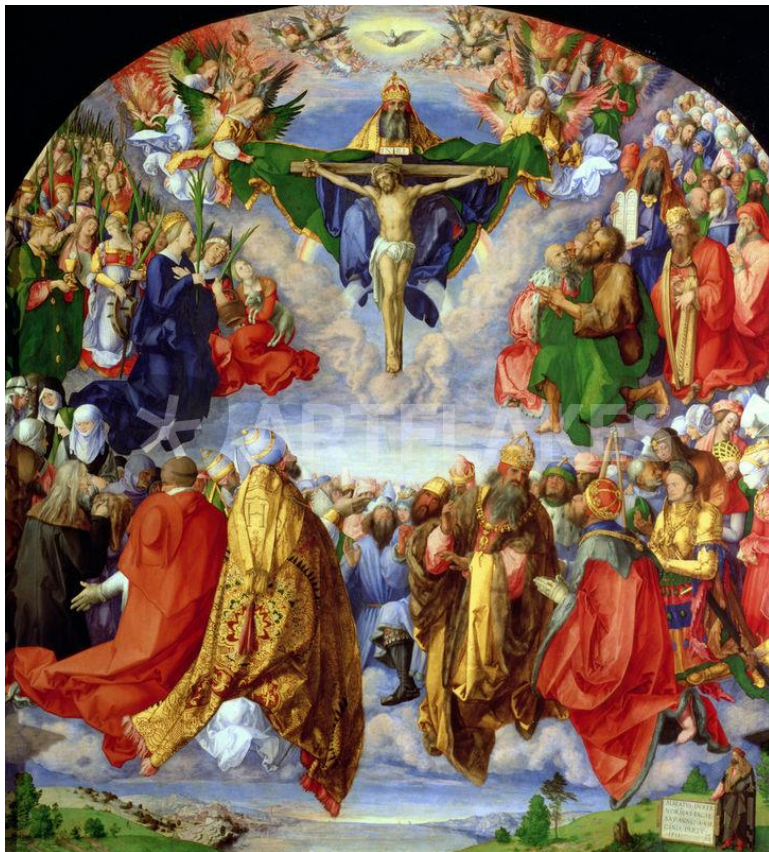
Albrecht Durer Adoration of the Trinity 1509 – 1511 Kunsthistorisches Museum, Vienna