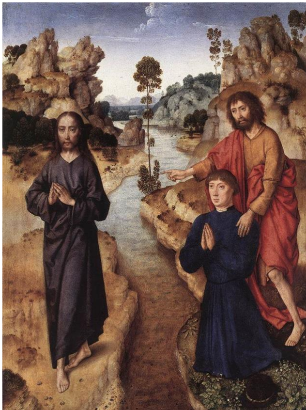
Dieric Bouts Ecce Agnus Dei 1462-64 Alte Pinakothek, Munich