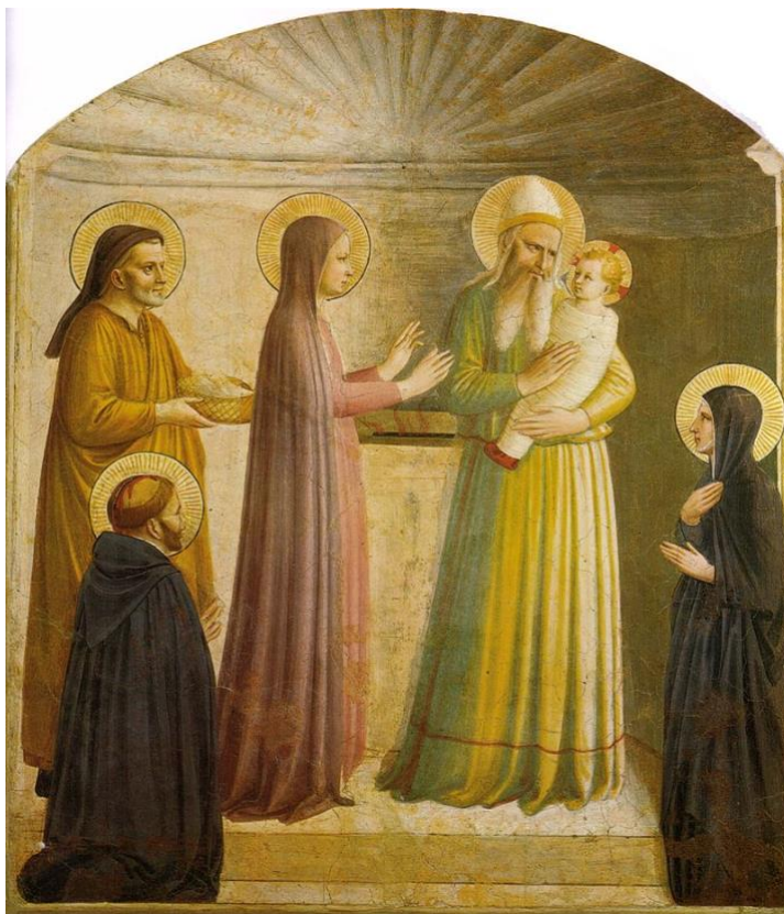
Fra Angelico The Presentation of Jesus in the Temple 1440-1442 Florence

Fourth Sunday of the Year 31 January 2021 Year of St Joseph