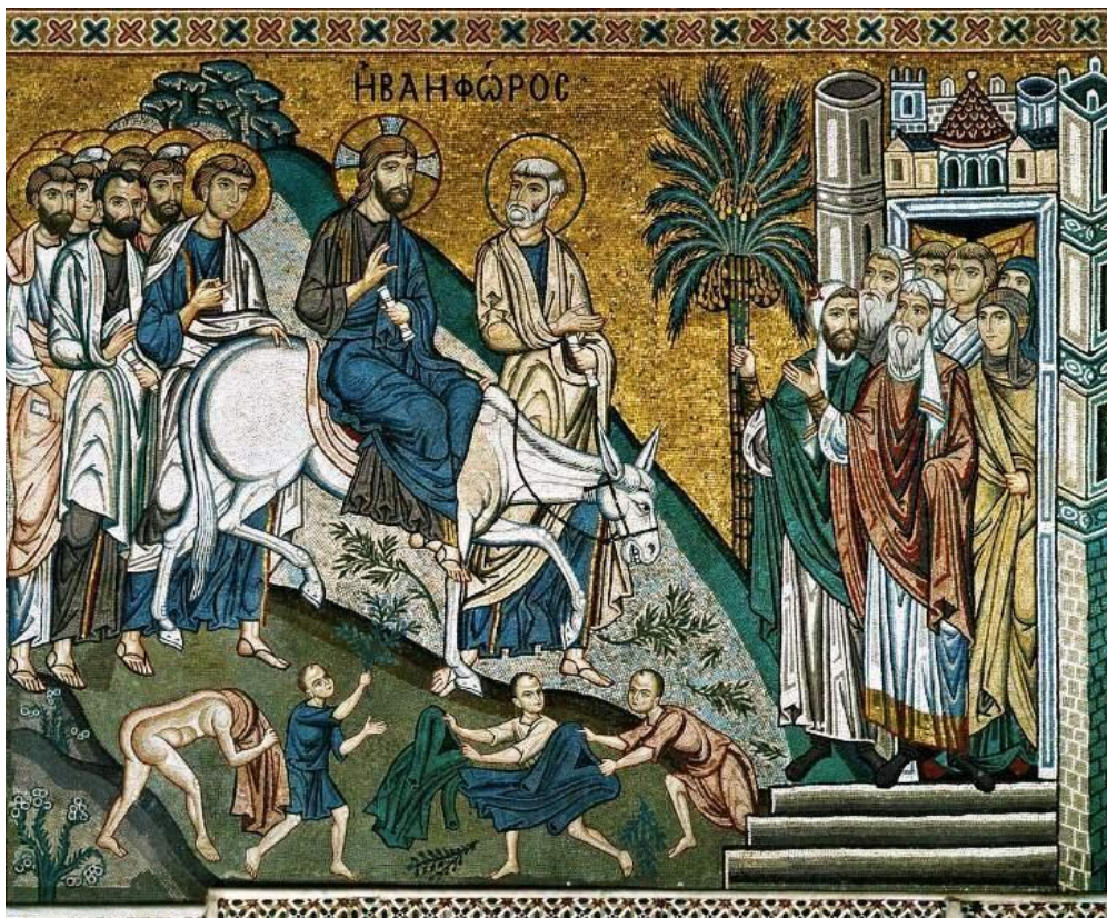
Norman mosaic Cappella Palatina 1140's Palermo, Sicily

Palm Sunday 28 March 2021 Year of St Joseph