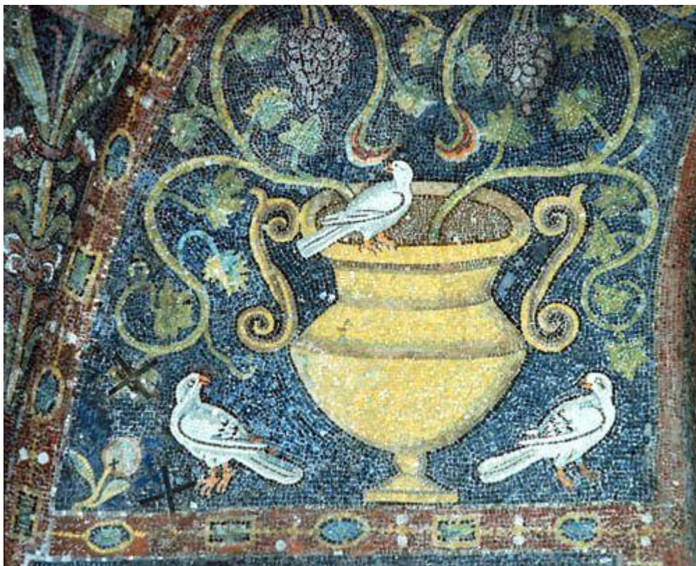
6 th century Byzantine mosaic Vine & dove, Symbols of the Resurrection San Vitale, Ravenna

Fifth Sunday of Easter 2 May 2021 Year of St Joseph